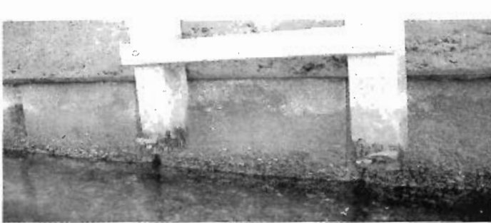
Ladder at Radio Bay

The ladders at Radio Bay are in deplorable shape, some with shaky steps and rusty spikes at the base that could injure a person or puncture an inflatable. Kim Magnuson and Larry Peck agreed to meet with Ian Birnie to suggest improvements. Want proof anybody?