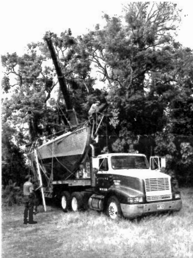
Ed's copper bottomed "Pueo" loading up to move from Wailoa boat storage to launch.

Membership Dues - Dues are $40 for Regular Family Membership, $24 for Associate (off island) and $20 Juniors/Fulltime Students