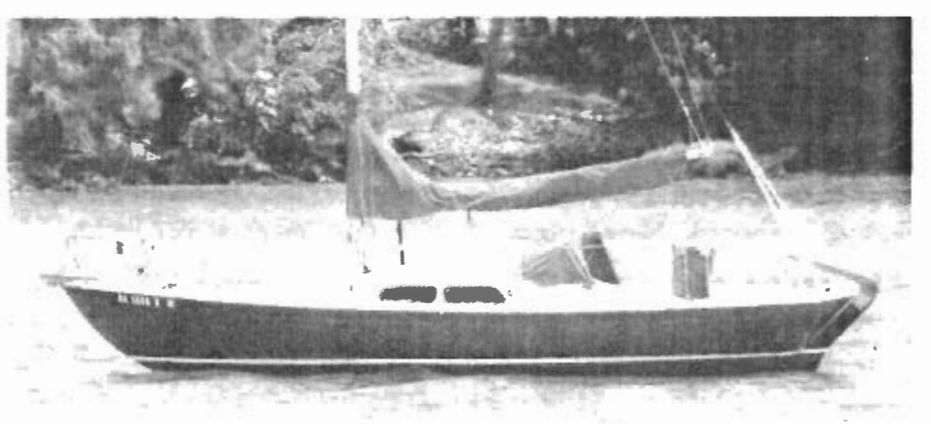
"Cheers" a 26 Foot International Folkboat

Are you ready to make that pledge? Call Ron daytime at 961-5812 or evenings 967-8603