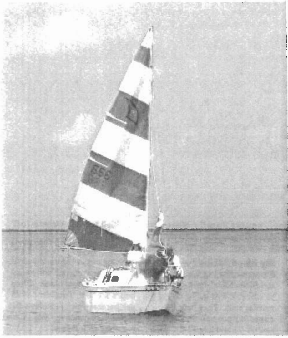
"Makani Kai" a West Wight Potter 19

The West Wight Potter 19, "Makani Kai," offers our Club a special opportunity for members to learn how to come off and go on a mooring in Reeds Bay where sailing is challenging.