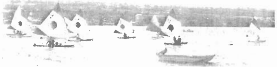
photo you will also notice the lowered sail so that the forward ends of the booms are nearly touching the deck. Although this makes it harder to duck under the boom and to see what is leeward it makes for a faster boat.

streaming piece of audio tape at the top of the upper boom will assist you in sail adjustment. More hints to follow in future articles.