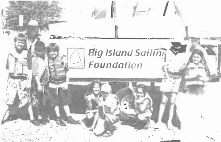
To the right is one happy Big Island Sailing Foundation sailing student.

Below is a photo of our almost newly acquired International Folkboat, "Cheers." Many clubmembers have pledged their dollars for the acquisition.